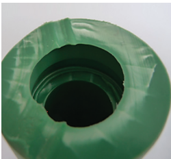
Inserted too little